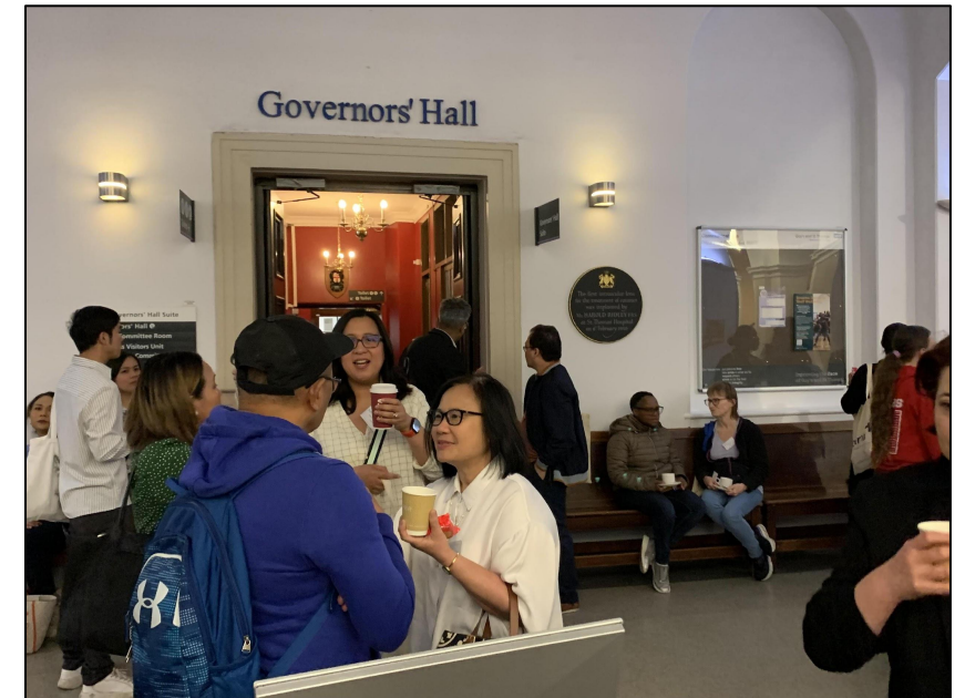
Governor's Hall entry : across the corridor from Exhibition Area